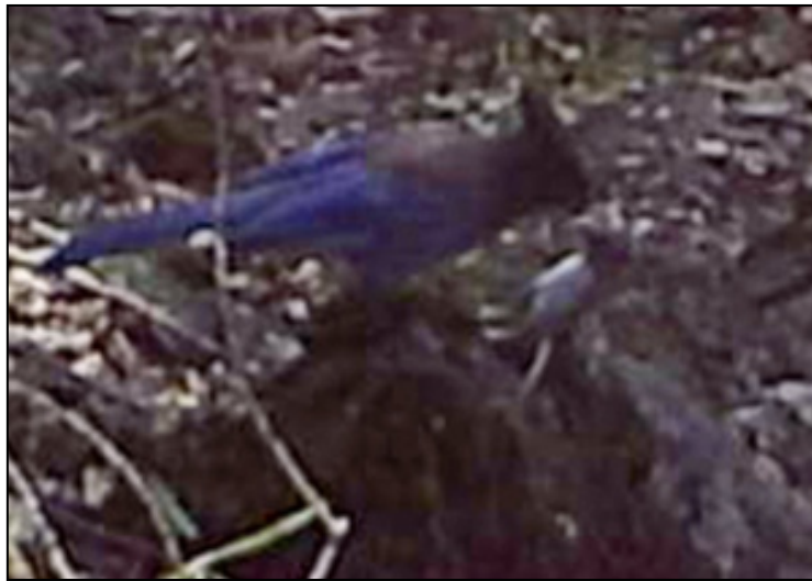
FIGURE 1. A trail camera photograph of a Steller's Jay ( Cyanocitta stelleri ) adjusting its hold on a Deer Mouse ( Peromyscus maniculatus ) before flying off with the mouse.

North American Deermice build nests of vegetative materials that may be located in trees, under rocks, or underground (Wolff and Durr 1986). Because the mouse was a juvenile, it may have only recently made a first venture from a nest site, and a lack of developed senses may have contributed to its vulnerability to predation. The increased deployment of camera traps may reveal that Steller's Jays are as adept at locating a concealed mouse nest as they are the arboreal nests of birds. This event occurred when Steller's Jays are likely to be raising young, and a high protein meal of that size would be an especially rewarding find for parents. Predation by Steller's Jays on rodents may occur more frequently than we realize and further targeted investigation is warranted.