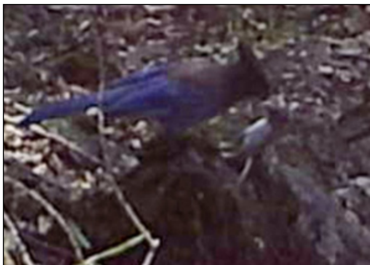
FIGURE 1. A trail camera photograph of a Steller's Jay ( Cyanocitta stelleri ) adjusting its hold on a Deer Mouse ( Peromyscus maniculatus ) before flying off with the mouse.

North American Deermice build nests of vegetative materials that may be located in trees, under rocks, or underground (Wolff and Durr 1986). Because the mouse was a juvenile, it may have only recently made a first venture from a nest site, and a lack of developed senses may have contributed to its vulnerability to predation. The increased deployment of camera traps may reveal that Steller's Jays are as adept at locating a concealed mouse nest as they are the arboreal nests of birds. This event occurred when Steller's Jays are likely to be raising young, and a high protein meal of that size would be an especially rewarding find for parents. Predation by Steller's Jays on rodents may occur more frequently than we realize and further targeted investigation is warranted.