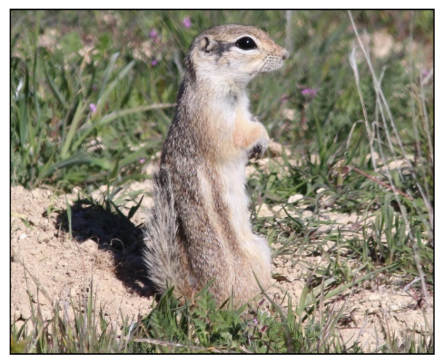
FIGURE 1. San Joaquin Antelope Squirrel ( Ammospermophilus nelsoni) from the Panoche Hills, San Benito County, California.

Study sites. —I collected fecal samples at two locations: a 13-ha live-trapping study plot located on the Elkhorn Plain, San Luis Obispo County, and at the Paine Preserve in Kern County. The Elkhorn Plain is situated between the Carrizo Plain and the Temblor Range. The topography of the study area is rolling terrain gently sloping upward to the east. Vegetation at the site was dominated by grasses and widely spaced shrubs, primarily California Jointfir ( Ephedra californica ), with a few Anderson's Boxthorn ( Lycium andersonii ). Smaller Yellow Aster ( Eastwoodia elegans ) and buckwheat ( Eriogonum spp.) were common. Herbaceous cover was dominated by the introduced annual grass Arabian Grass ( Schismus arabicus ) although a number of other grasses and herbs were present.